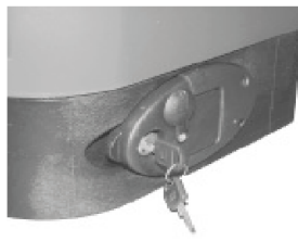
Insert key and turn clockwise