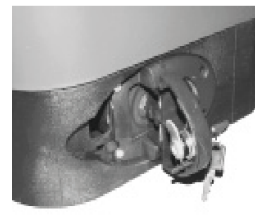
Pull door to release

The manual release in the open position also deactivates the electronic control. To operate the unit normally the release door must be fully closed.